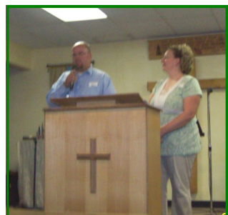
We gave our testimony and presentation to a very welcoming group of believers at Faith Center Church in Clinton, IA.